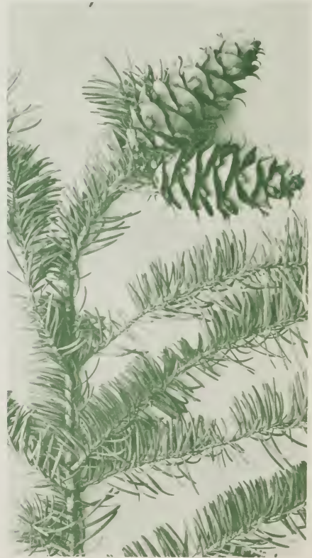
Douglas-fir. F-308969 (About one-third natural size)

Most of the small (table-size) artificially colored Christmas trees seen on the markets at Christmas-